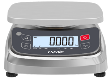
FCS SST Waterproof Scale