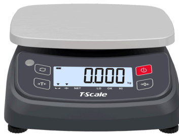
FCW ABS Waterproof Scale