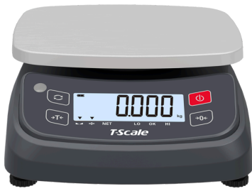
FC ABS Scale