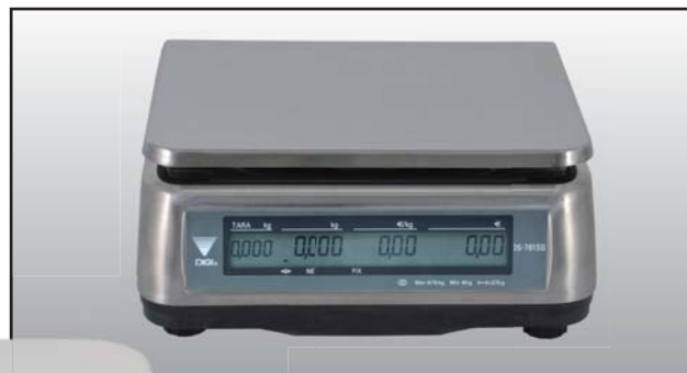
Customer side display